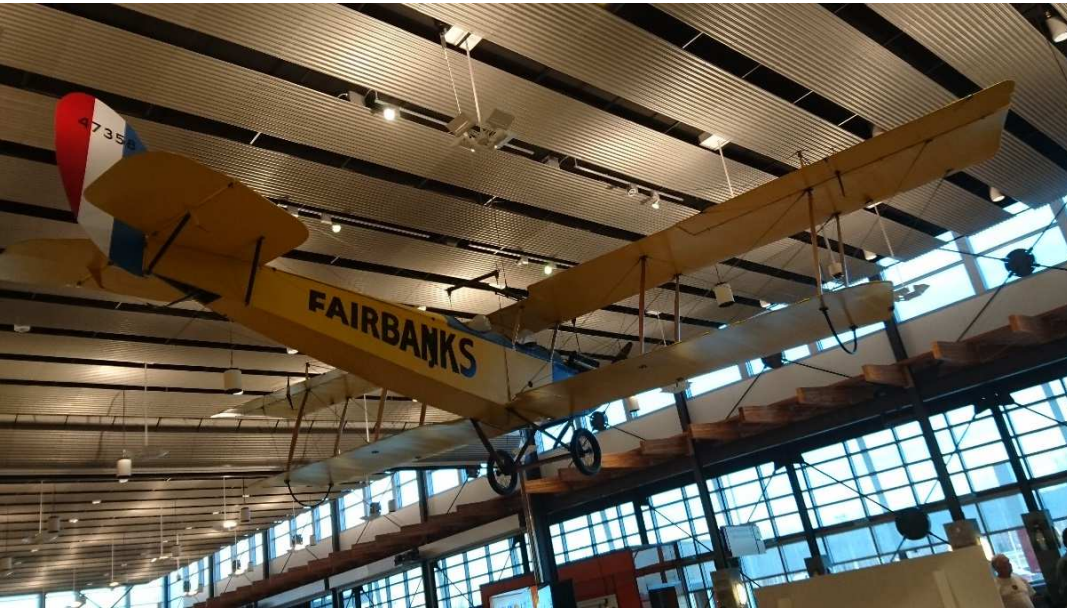
Fairbanks International Airport