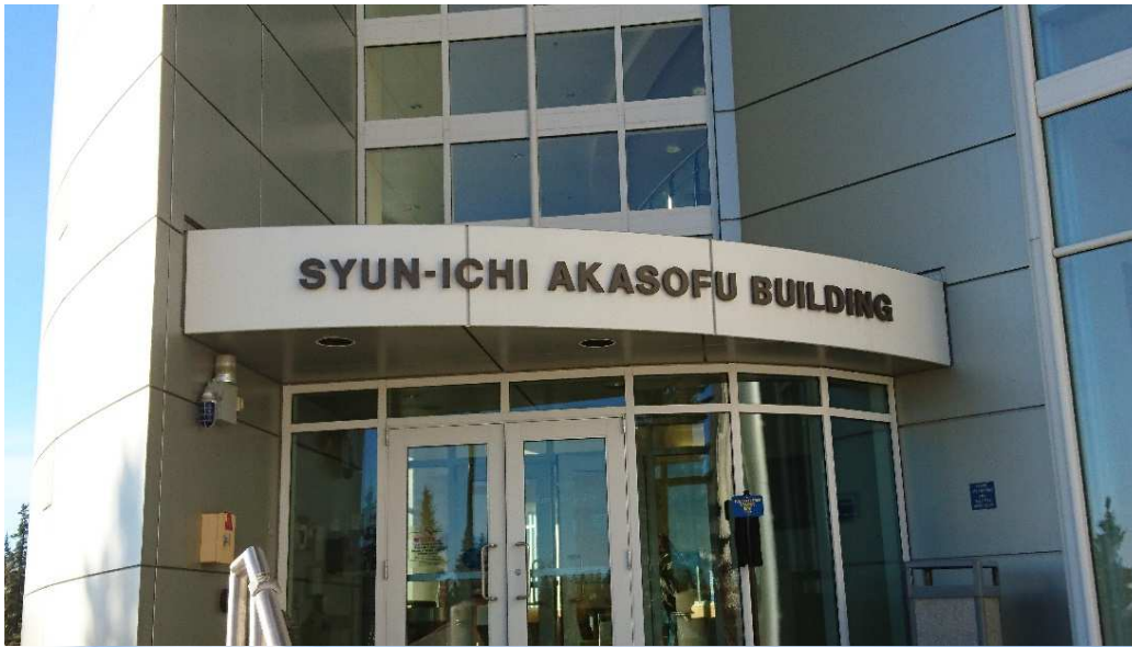
University of Alaska (AKASHOFU BUILDING)