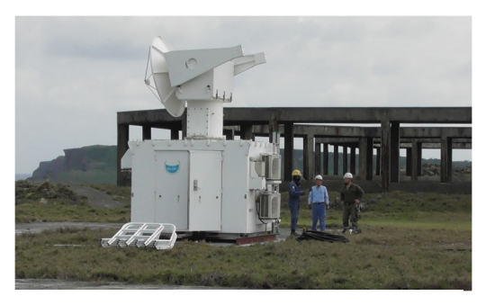
Ka-band radar installed on Yonagunijima.

In the United Arab Emirates Precipitation Intensification Science Program "Advanced Research on Precipitation Intensification in Arid and Semi-arid Regions," the investigation of the effects of cloud-aerosol processes on cumulus development and precipitation