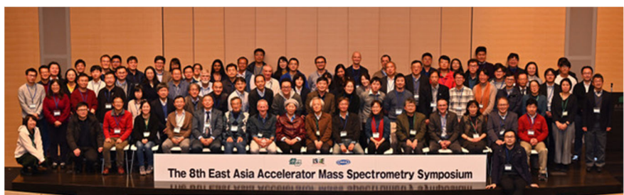
The participants of the 8th East Asia Mass Spectrometry Symposium.

One prevalent topic was studies dealing with historical solar activity by performing high-precision ^{14}\text{C} and ^{10}\text{Be} accelerator mass spectrometry analyses of annual tree rings and ice sheet cores. In the session “Space and Earth Environmental Science,” the latest studies about past solar changes were presented; e.g., “Evidence for solar-flare and other cosmic-ray events in the ^{14}\text{C} record in tree rings and in the other records” by A. J. T. Jull (Dept. of Geosciences, University of Arizona), F. Miyake (ISEE, Nagoya University), and I. Panyushkina (Lab. for tree-ring research, University of Arizona).