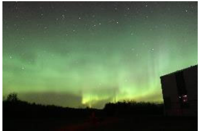
Polar aurora as an indicator of plasma–atmosphere interactions (photo taken at Athabasca, Canada on October 4, 2019, during an ERG-ground campaign observation).

At middle- and low latitudes, various scientific results have been obtained in FY2019, mainly using multi-point ground-based airglow and GNSS observations. As an example, we studied atmospheric gravity waves (AGWs) and medium-scale traveling ionospheric disturbances (MSTIDs) using more than 10 years of airglow images obtained in Canada, Russia, and Japan. We show positive correlations between the power of the AGWs in the mesosphere and MSTIDs in the ionosphere, suggesting the generation of MSTIDs by AGWs from the lower atmosphere. A 3-dimensional Fourier analysis of these airglow images also provided wavenumber spectra and their latitudinal, longitudinal, local time, and solar activity dependences in the mesosphere and ionosphere.